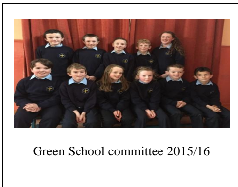
Green School committee 2015/16

Thank you and keep up the good work. Children are expected to wear the school uniform every day, except on P.E. days when school tracksuits should be worn.